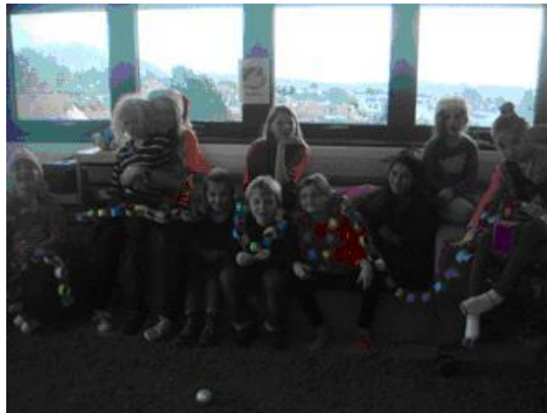
one of our consultative groups

Happy Christmas from everyone at Triangle